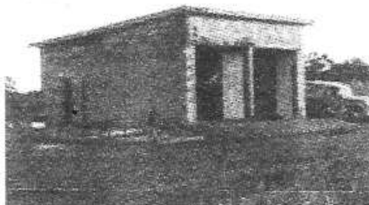
Eureka Motors original premises in 1961