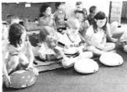
Year 1 children thinking like computer programmers.

Receive school information, instantly and directly to your smartphone or mobile device. Download from your app store free. And keep up with everything that's happening at school at the touch of a button.